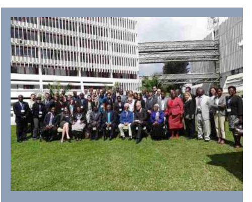
Auschwitz Institute Facilitates Dialogue in Tanzania on Mass Atrocity Prevention

On May 27 & 28, 2013, Lemkin Seminar alumni from 22 countries gathered in Arusha. Tanzania. for an AIPR-organized conference titled, "Best Practices and New Opportunities in Genocide Prevention: Governmental Action, Technology, and Regional Contexts." At this meeting, African civil society organizations discussed their work to prevent genocide and other mass atrocities in their home countries and regions and highlighted the opportunities for cooperation between government and civil society.