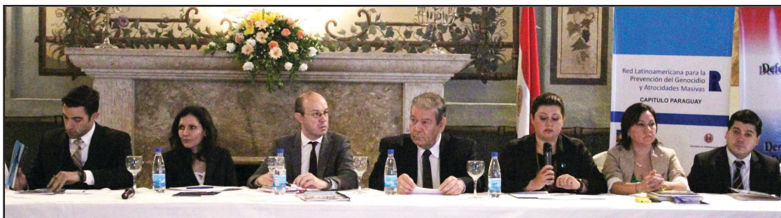
The launch of Paraguay's National Commission for the Prevention of Genocide and Mass Atrocities in April, 2013