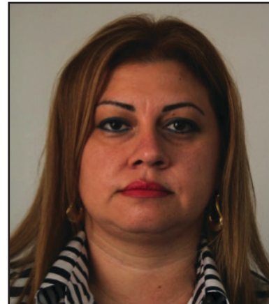
Yudith Rolón Director of the Department of Truth, Justice and Reparations of Paraguay's Office of the Ombudsman

In the meantime, the Ministry of Foreign Affairs and the Office of the Ombudsman continue to develop programming and policy for prevention specifically with regards to Paraguay's Truth Commission, which handled cases of potential atrocity crimes that took place during the military dictatorship from 1954-1989.