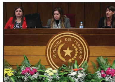
Dialogue on Prevention in Asunción, August 2014