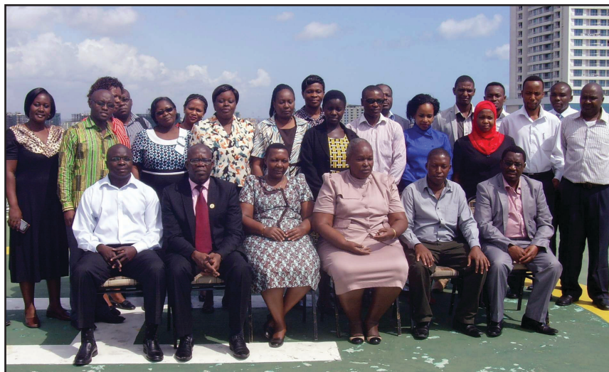
Tanzania's National Committee for the Prevention and Punishment of the Crime of Genocide, War Crimes, Crimes Against Humanity and All Forms of Discrimination