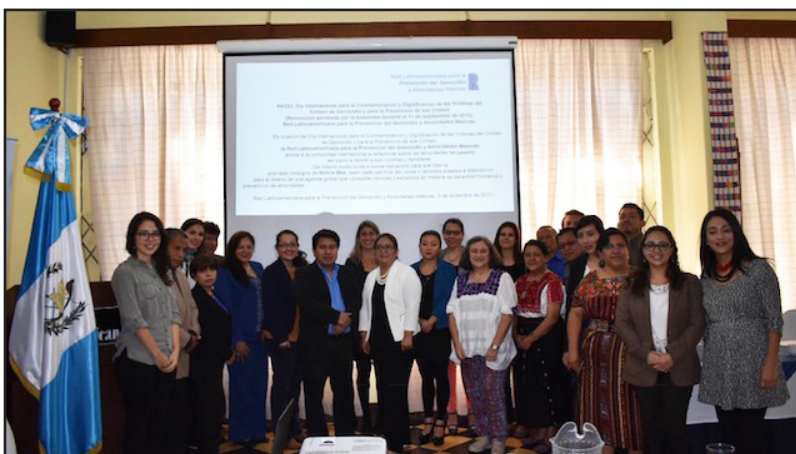
Participants of a December 2017 training seminar on mass atrocity prevention held in Guatemala City included representatives of the Office of the Ombudsman, Ministry of Governance, Ministry of Foreign Affairs, Secretariat of Social Welfare, and National Program for Reparations, in addition to members of civil society organizations and academia. Events such as these represent excellent opportunities to carry out informal inter-ministerial work on the prevention of atrocity crimes, laying the foundation for a National Mechanism.

A growing number of states around the world, like Finland, have demonstrated a commitment to atrocity prevention and the understanding that this work must be implemented in a coordinated manner by those offices with a responsibility for addressing risk factors. While a formal decision may not yet be taken to pursue the establishment of a National Mechanism in these states, the work of R2P Focal Points lays the groundwork for such a body to be developed in the future.