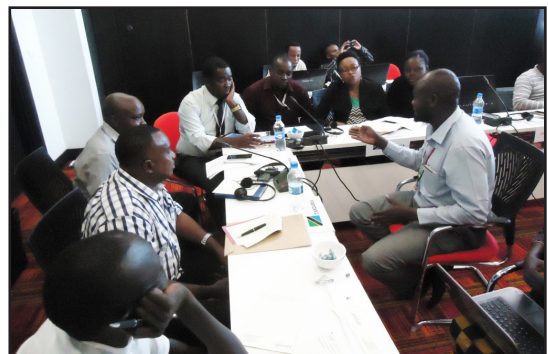
Regional Training Seminar - "Mass Atrocity Prevention in East and Southern Africa Today" Dar es Salaam - March 15-17, 2016