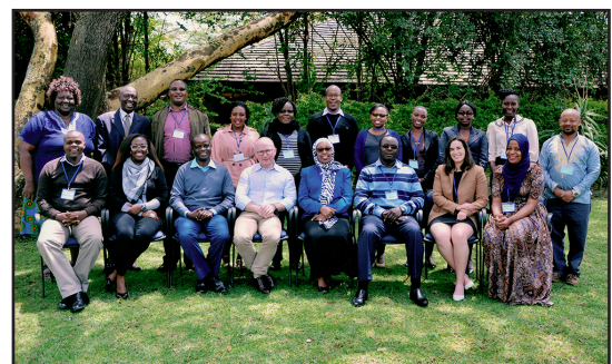
Strategic Planning Meeting Naivasha, Kenya - February 23-25, 2017

Having organized several robust initiatives, the KNC predicts seeing a credible and peaceful 2017 Kenyan General Election. Over the longer term the KNC will track additional indicators of success through the enactment