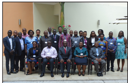
Regional Training Seminar - "Deepening the Institutionalization, Networking and Capacity Building of National Committees for Genocide and Mass Atrocity Prevention" Dar es Salaam - December 7-9, 2016

Challenges with regard to these plans include serious budgetary constraints, the absence of a dedicated office for the Secretariat, and the lack of a nationwide non-state actor network for inter-religious cooperation.